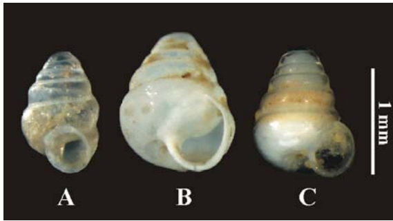
Figure 3 – Zospeum individuals found June 2011 in Spain A. Zospeum sp. nov. 1 from Cueva Arrikruz; B. Zospeum sp. nov. 3 from Cueva de las Paúles; C. Zospeum cf. suarezi from Cueva de las Paúles.

cave systems at a particular time. The population along the walls of Cueva Arrikruz encompassed a vast tapestry of dried shells as well as a proportionately large number of living individuals within a few square centimeters. In a 200-gram sample of sediment, five live adult individuals and five live juveniles were collected. This sediment contained an additional, mainly translucent (a key indication of recent mortality) 450 empty adult shells and ca. 150 empty juvenile shells suggesting a 1.5 - 2.0% survival rate witnessed for the summer month of June. On the other hand, if emptied shells can maintain a fresh, translucent appearance for many years, these shells could well have accumulated through many generations. We attribute this spectacular find partly to easy accessibility to the upper level of the cave via a modern walkway constructed for tourists. Under normal speleological conditions, caves must be navigated more laboriously considering water levels, time of year and narrow passageways that otherwise complicate the already difficult location of living individuals in ephemeral populations of these cryptic microsnails (Figure 4).