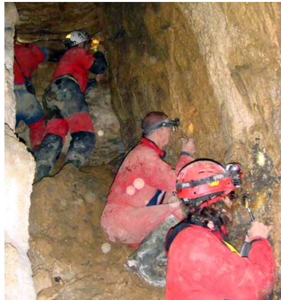
Figure 4 – Zospeum hunt in June 2011

It is presumed that the populations in Cueva Arrikruz and Cueva de Las Paúles were most likely able to sustain themselves as colonies for many generations due to continuous, consistent environmental conditions such as temperature, humidity, airflow, water levels and the influx of organic material. Moreover, the patched fungal colonies associated with these populations may well serve as a food source or even comprise a symbiotic relationship in respect to the breakdown of fecal matter and the metabolic processes enabling the colonization of these minute snails. These pivotal findings enable new insights concerning their characteristic ellobioid colonization in mud and their adaptation to a troglobitic ecology.