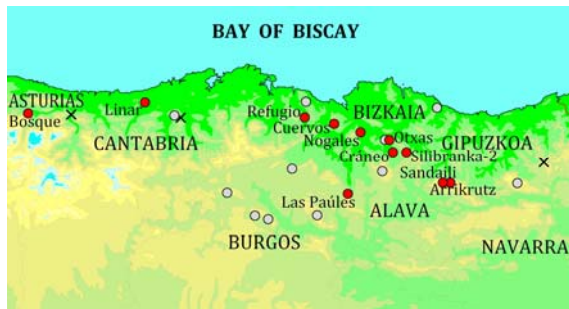
Figure 1 – Caves sampled for Zospeum in northern Spain

Red circle indicates caves explored (June 2011) containing Zospeum populations; X indicates caves explored (June 2011) not containing Zospeum populations; White circle indicates caves known to contain Zospeum populations but not sampled on this excursion.