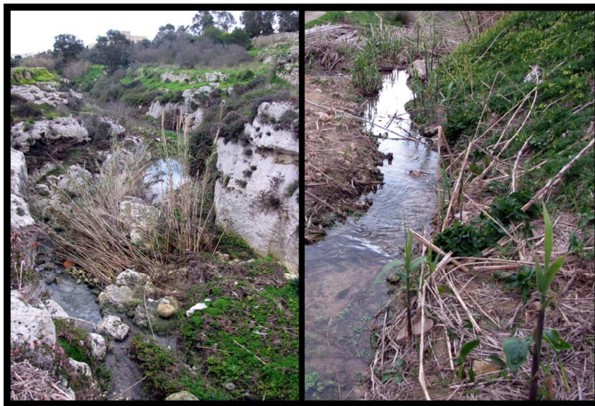
Figure 2 – Sampled sites in Malta: left Mosta site; right Bahrija

et al. 1986), as well as in some Pacific islands, where it was probably introduced accidentally with vegetation from outside the region (Haynes 1990; Ellison 2008). On the other hand, Giusti et al. (1995) are of the opinion that Malta is probably in the species natural range, especially given the fact that Quaternary fossils are known from Puglia and the Balearic Islands (Esu 1980; Beckmann 2007).