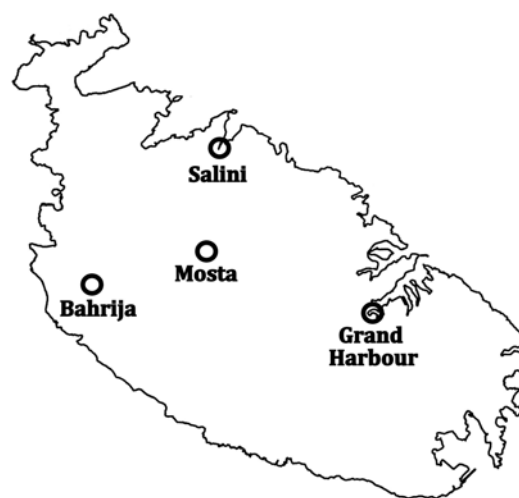
Figure 1 – Locations in Malta from which Melanoides tuberculata (Müller, 1774) has been recorded, according to Issel (1868), Cachia (1981) and the present study.

likely that the species was "re/introduced" on account of its popularity with aquarium owners, establishing itself as easily as it did northward of Africa, for example in Austria (Stagl 1993), Germany (Glöer & Meier-Brook 1994), and even further afield in the Americas in North America (Russo 1974), Mexico (DC ex coll.) and Brazil (Vaz